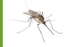
Mosquito Family Culicidae