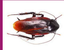
Smoky-Brown Cockroach Periplaneta fuliginosa