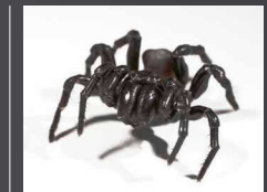
Sydney Funnelweb spider Atrax robustus