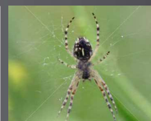
St Andrew's Cross spider Argiope spp.