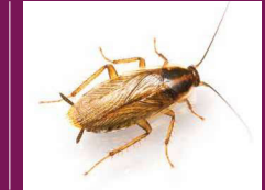
German Cockroach Blattella germanica