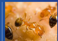
Singapore ant Monomorium destructor