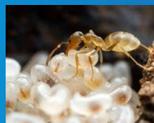
Brown house ant Doleromyrma darwiniana