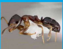
Black house ant Ochetellus glaber