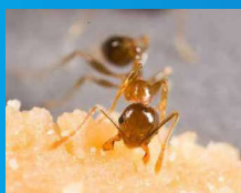
Coastal brown ant Pheidole megacephala