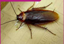
American Cockroach Periplaneta americana