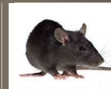
Roof rat Rattus rattus