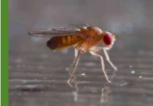
Vinegar fly Family Drosophilidae