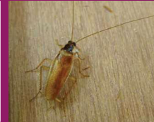
Brown-Banded Cockroach Supella longipalpa