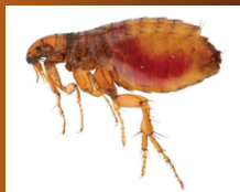
Dog flea Ctenocephalides canis