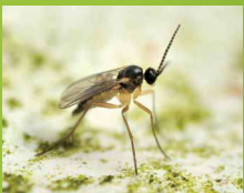
Sciarid fly Family Sciaridae