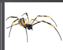
Golden Orb Weaving Spider Nephila spp.