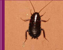
Oriental Cockroach Blattella orientalis