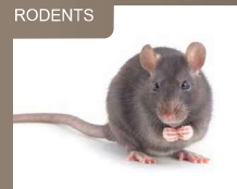
Norway rat Rattus norvegicus