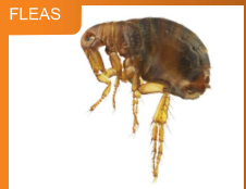
Cat flea Ctenocephalides felis