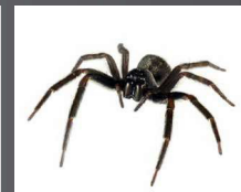
Black House spider Badumna insignis