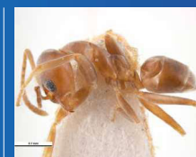
Argentine ant Linepithema humile