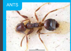
White-footed black house ant Technomyrmex albibpes