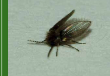
Drain (Moth) fly Family Psychodidae