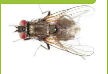
House fly Musca domestica