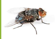
Blow fly or Bluebottle Family Calliphoridae