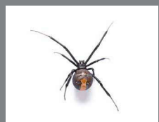
Redback spider Latrodectus hasselti