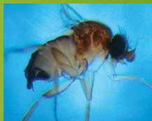
Phorid (Hunchback) fly Family Phoridae