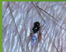
Biting midge Family Ceratopogonidae