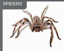
Huntsman spider Family Sparassidae