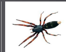
White Tailed Spider Lampona cylindrata