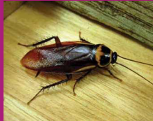
Australian Cockroach Periplaneta australasiae