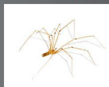
Daddy Longlegs spider Pholcus phalangioides