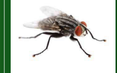
Flesh fly Family Sarcophagidae