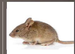
House mouse Mus domestica