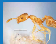
Pharaoh's ant Monomorium pharaonis